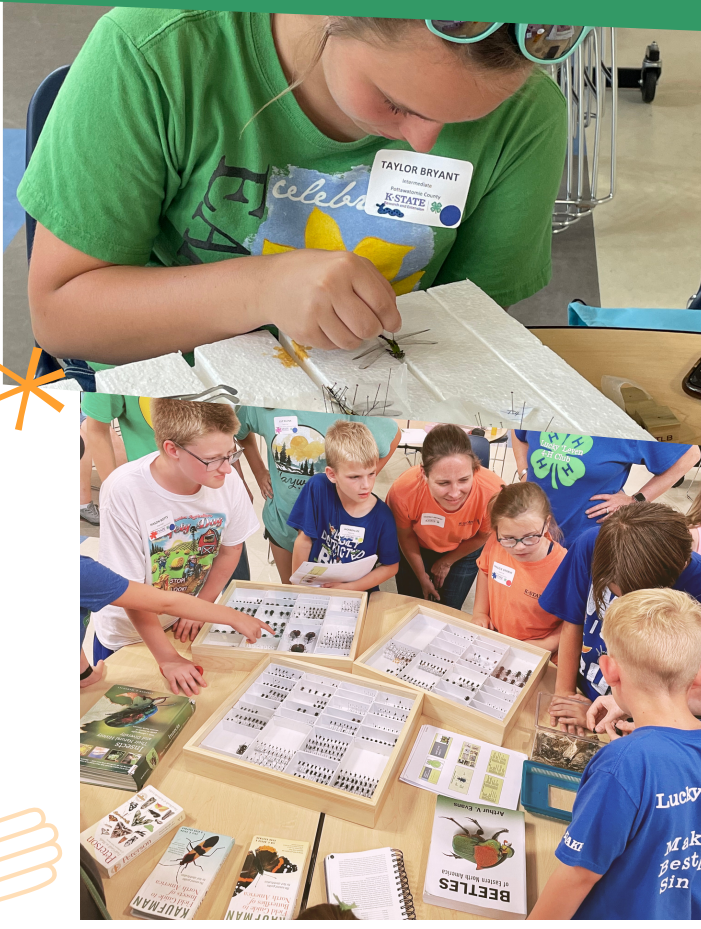
exhibit boxes without plexiglass lids available for

purchase at the workshop. We hope to have a few